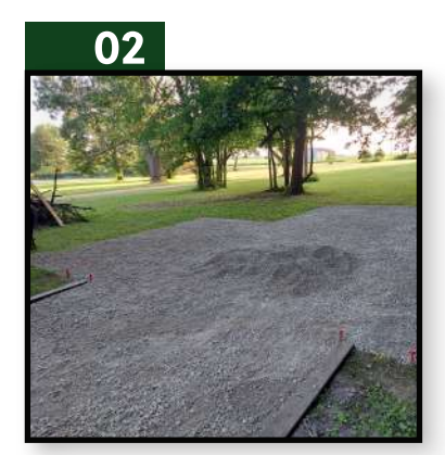
*THIS STEP IS THE CUSTOMER'S RESPONSIBILITY. HOWEVER, WE CAN REFER CONTRACTORS TO HANDLE THIS STEP FOR YOU.

THE REMAINING BALANCE WILL BE DUE PRIOR TO DELIVERY.